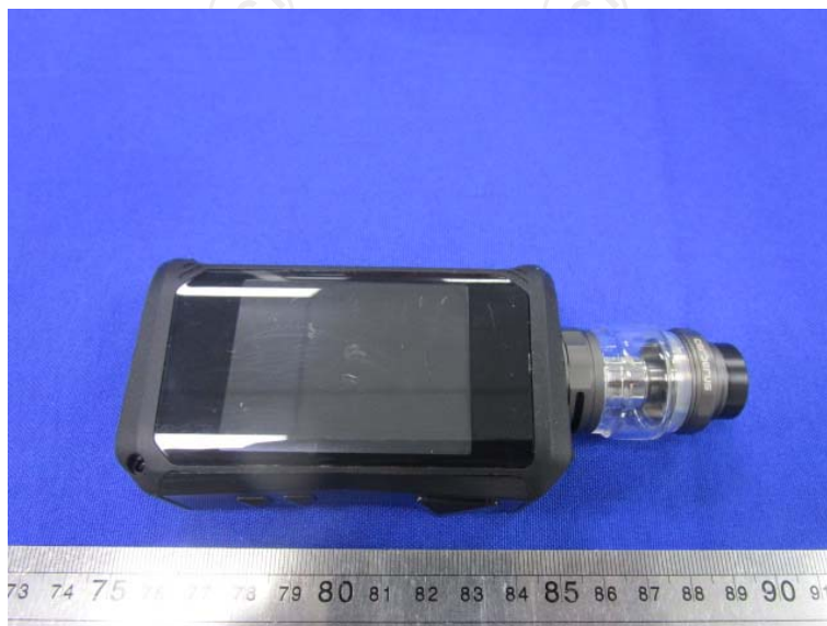
GEEKVAPE AEGIS X KIT